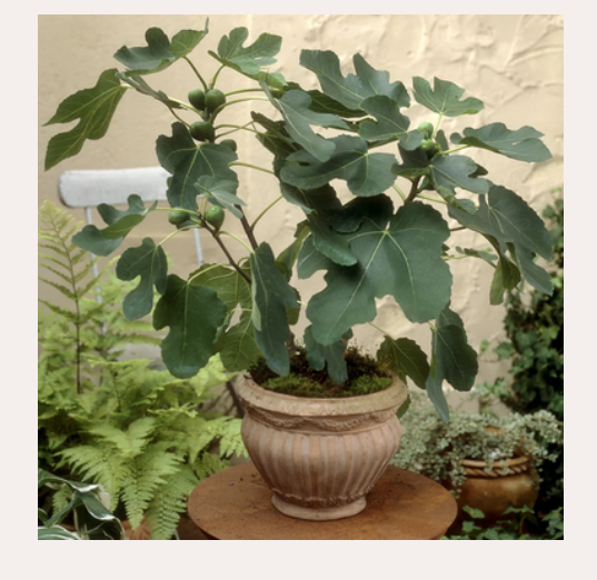
PLANT A NEW PLANT IN THE GARDEN